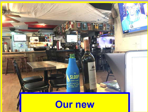
Our new hangout...The Sloop

A few days in the hotel while we had the house cleaned... then on January 1st, we moved the dogs, the cats and us into the new Lyons Den in Foley, Alabama. We are loving the area - so much to do, delicious restaurants, friendly people, lots of live music and outdoor fun! Gulf Shores public beach is a quick 15 minute drive. We did find our local spot to bring the laptops and have a beverage while using their good wifi - The Sloop. Amazing food and staff - yes, we are already regulars.