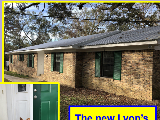
The new Lyon's Den and guard dog, Roo!

The day after Christmas, a 20' U-Haul, the pickup, four drivers, two dogs and two cats pulled out of Phoenix and headed east. For all the craziness of 2020, the year allowed us to pull the trigger and make the move to Lower Alabama.