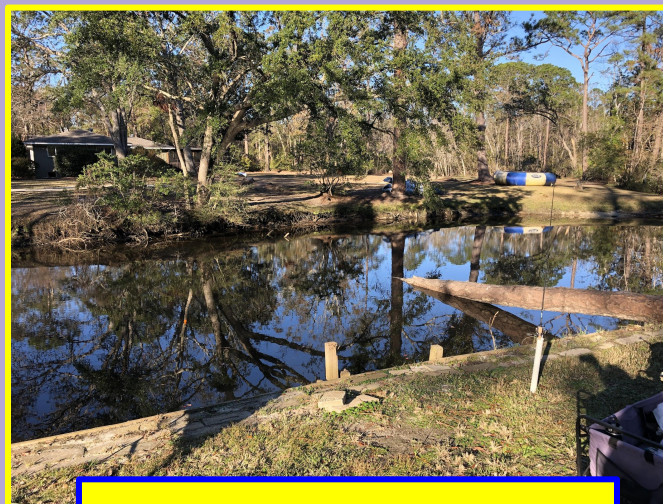
Our boat slip...whoo-hoo!!!

After some intense U-Haul Tetris (we had amazing loaders) and a few last minute "well, that won't fit" decisions, we pulled out of the driveway at 2:45pm PST December 26 and pulled into the hotel in Gulf Shores at 8:30pm CST December 27. We made it!!!