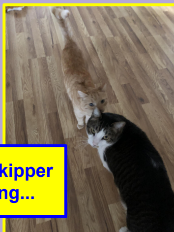
Walter and Skipper are adjusting...

If anyone is out this way, be sure to call us - our door is always open and maybe the boat will be in place???